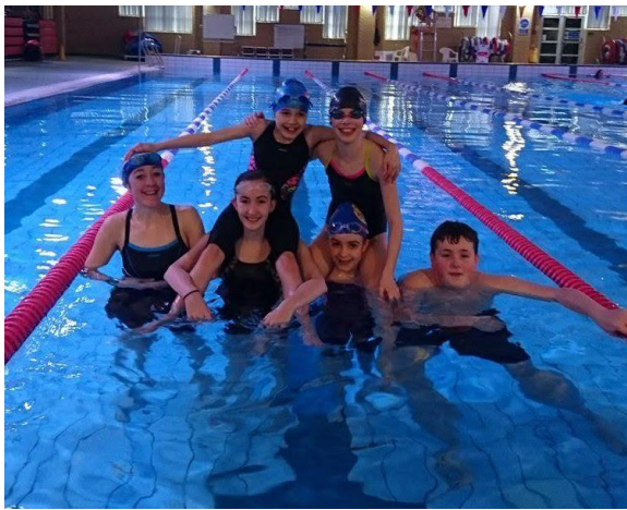
The Swimathon team of swimmers 2018