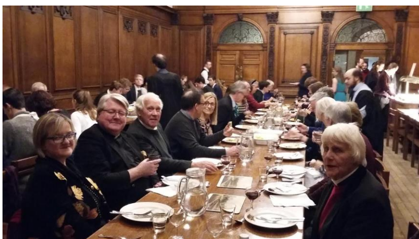
Dinner at Clare College after a recital & evensong

We consider social justice to be central to the gospel and this commitment supports vulnerable groups within nearby towns and national and international charities.