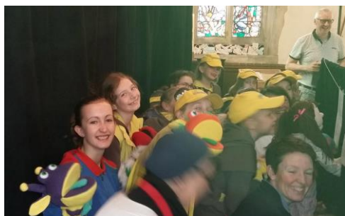
Brownies helping with puppets