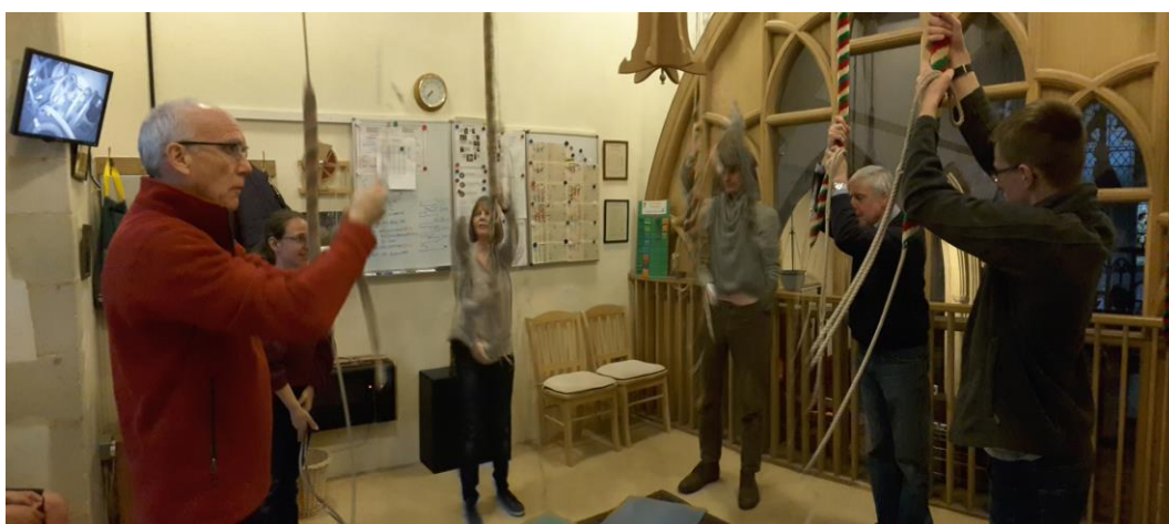
Ringling for service

There is an active and enthusiastic group of bell ringers at Great Gransden who practise weekly. There are six bells with a tenor of 600kgs. Presently there are 11 ringers ranging in age from 17 to 70. The bells are rung for all services, and for weddings and funerals as requested. Other ringing is arranged for special local and national events. Visiting ringers from other churches are welcomed. Two of the ringers are accredited Ringing Teachers and training is carried out using materials from the Association of Ringing Teachers. Dedicated training sessions are held using CCTV and computer programmes.