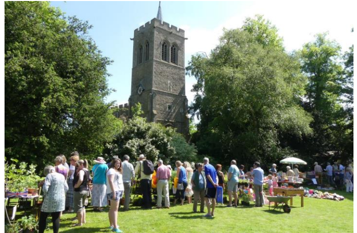
Great Gransden Church Fete 2018