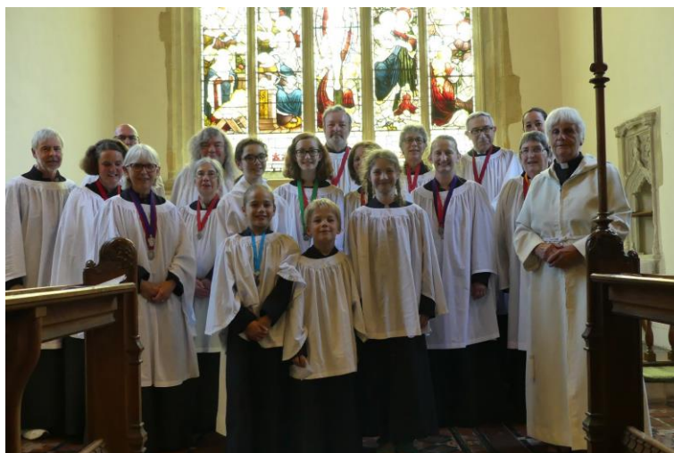
Music Sunday 2017

The Gransdens Church Choir enjoys excellent leadership under our Authorised Lay Minister for Music, practises weekly and achieves a high standard. The Choir is affiliated to the Royal School of Church Music, follow the training system 'Voice for Life' and supports events held in the Diocese and further afield. Six members have obtained Dean's (Bronze), Bishop's (Silver) or Senior Bishop's (Gold) Awards. The Gransdens has a permanent contracted paid organist and the Choir also supports some Group Services. The Choir is robed in cassock & surpluses. Most of our servers are drawn from the Choir and the younger members act as acolytes.